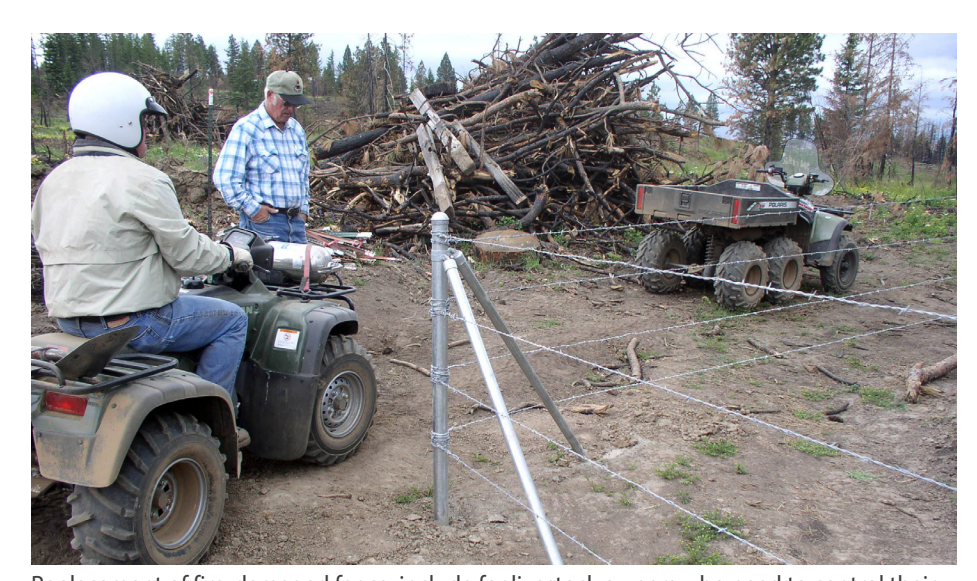
Replacement of fire-damaged fence, include for livestock owners who need to control their animals' movements.