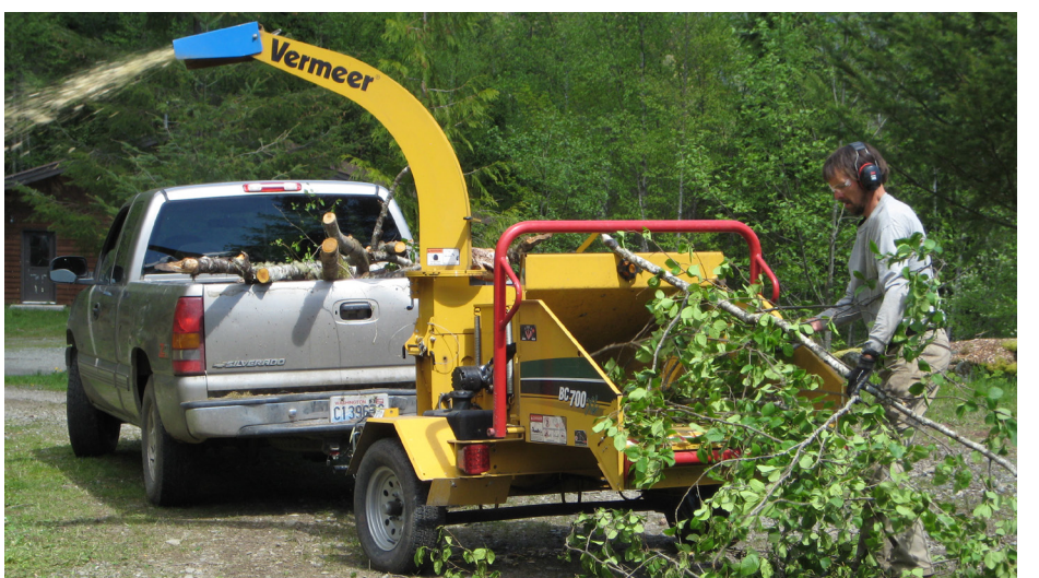
Wildfire fuels reduction, including offering wood chipper services to for landowners to remove branches and brush from their property that can add fuel to wildfires.