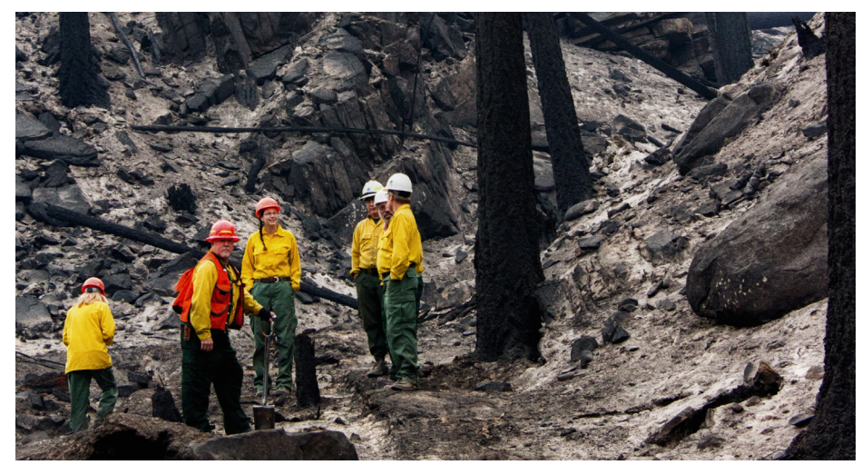
Identification and assessment of the number of lands, landowners, properties, and operations damaged by wildfire.