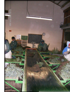
The Processing Line