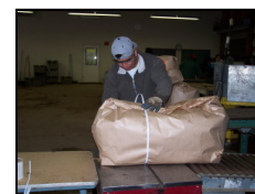
Bagging & Banding