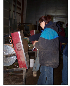
Bundling & Banding

The PMC begins harvest once the plants have gone dormant, which is usually around the 1st of December. Before any plants are lifted, a crew needs to be hired. The harvest crew typically consists of 24 people. Six of them are the lifting crew and 18 are in the packing shed, processing plants.