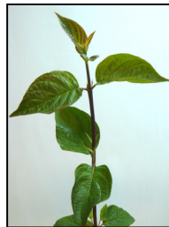
Red Osier Dogwood